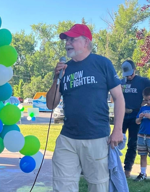
UPCOMING WALKS Register today at shinealightwalk.org