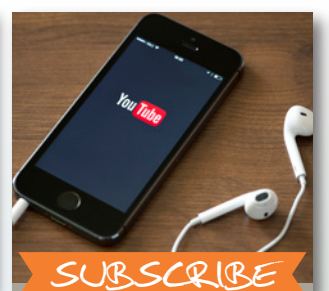
to our YouTube channel to watch for your video!