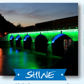
a Light in your community and add to the growing list of landmarks that will glow in CTF blue and green for NF Awareness Month.