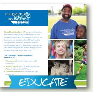
using facts sheets available at ctf.org/nfawareness .

your profile picture to one that celebrates NF Awareness.