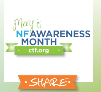
the many new May NF Awareness Month graphics we will be releasing all month long.

Children's Tumor Foundation on Facebook.